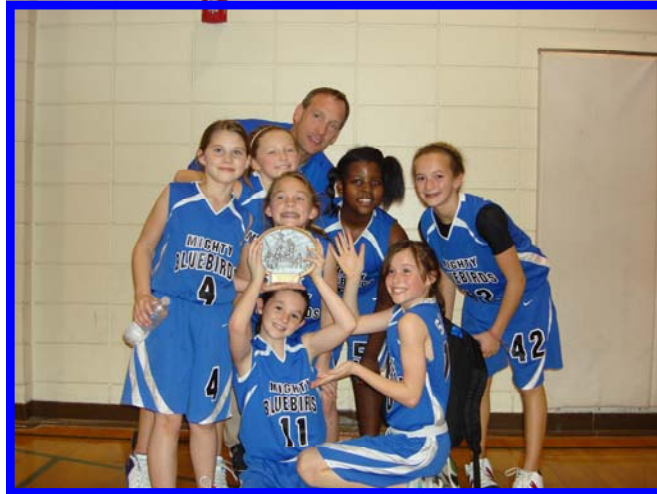
Mighty Bluebirds Basketball Team CHAMPIONS

Soccer State Cham- pions 1999, Oops, 2001, 2002, 2003, 2004, 2005, 2006, 2007, 2008, 2009 and 2010